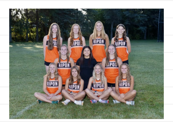
Girls Cross Country

The fall sports at RHS are in full swing. The RHS halls are filled with members of the Cheer, Cross Country, Girls Tennis, Football, and Volleyball teams.