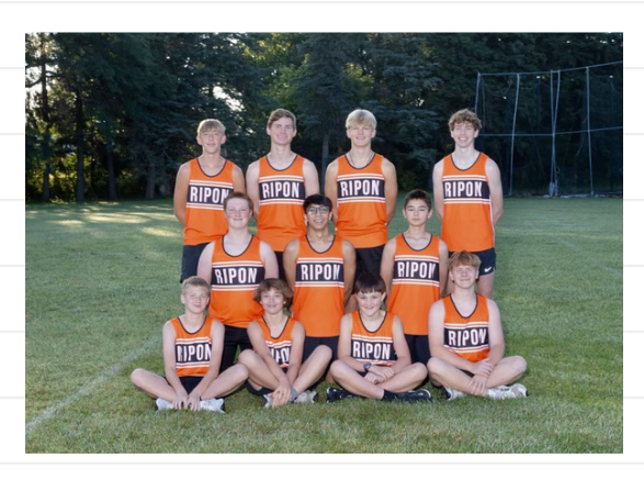
Boys Cross Country